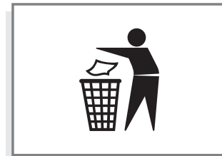
Step 7: Properly dispose the wipe and package