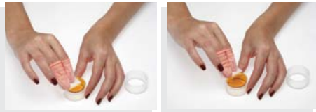
Step 3: Using an "S" motion, wipe from top to bottom