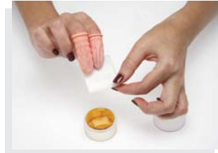
Step 5: Turn the wipe to the other side