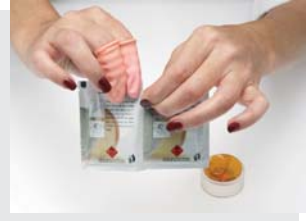
Step 1: Separate one wipe