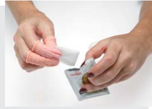
Step 2: Take out the folded wipe