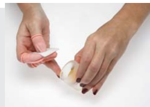
Step 4: Turn the lens upside down