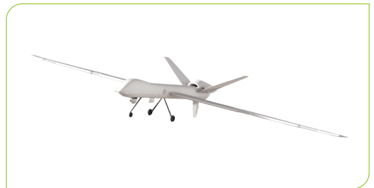
Fig.1: Unmanned Aerial Vehicle (UAV) with compact gimble payload

and commercial applications. In the area of defense and government, drones are used for military and police surveillance, border control, security, and search and rescue operations. Between 2009 and early 2017, at least 347 law enforcement and emergency responder agencies in the U.S. acquired drones 2 .