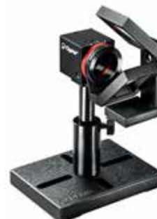
SPZ17015 + SPZ17026 (used either singularly or stacked)