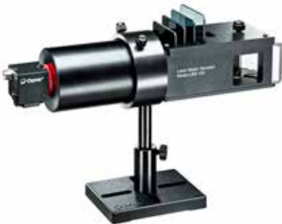
LBS-100 (SPZ17029) + LBS-100 combined with 4X beam reducer (SP90061+SPZ17017)