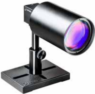
4X beam reducer

The 4X Beam Reducer is an imaging system that images the plane 30cm in front of the reducer onto the camera CCD sensor while reducing the size 4 times and inverting it. The beam reducer uses the 3 screw on attenuators provided with the camera. Since the intensity of a beam after reduction will be increased by 4 \times 4 = 16 times, it is advisable to attenuate the beam more than you would without beam reduction. This can be done with additional external beam splitters and attenuators which are available (see ordering information). Note that the custom designed beam reducer gives better image quality than tapered fibers since it does not introduce graininess or uneven pixel response. Also the image distortion of \sim 1\% is considerably lower than with most tapered fibers. The beam reducer is not compatible with CS mount cameras.