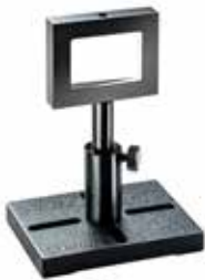
Optional large wedge beam splitter (SPZ17018)

Shown is an image of a laser with beam diameter of 13mm. As can be seen, it is easily seen with the SP920s, SP932U camera with the 4X beam reducer.