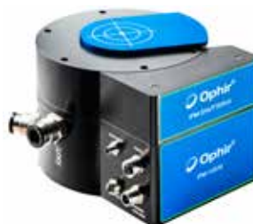
IPM-10KW with IPM-Shutter10