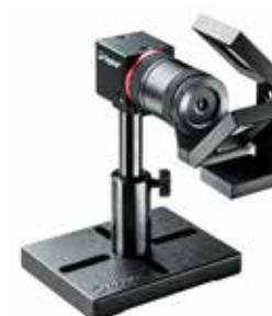
Camera with 4X Beam Expander SPZ17022, SPZ17027 Beam Splitter and SPZ17026 Beam Splitter