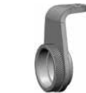
SP90437 C-Mount Mounting Plate & Locking Ring