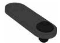
SP90436 Through Hole Mounting Plate