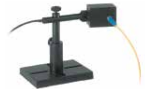
PD300 with F.O. Adapter Mounted