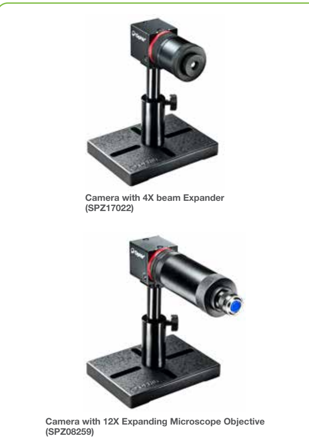
Camera with 4X beam Expander (SPZ17022)

For intensities too large to be accommodated by just filters, beam splitters are available to reduce the intensity before the beam expander. The beam expander is primarily intended for nonparallel beams such as focal spots and fiber tips. If small parallel beams are imaged, interference effects may occur. The 4X Beam expander can also be fitted with a UV converter plate at its object plane so that you can look at small beams in Wavelengths 193-360nm and expand them 4X.