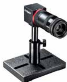
Camera with 4X Beam Expander and UV Image Converter

The UV converter is a UV sensitive fluorescent plate that can be mounted over the 4X Beam Expander. The plate is positioned at the object plane of the 4X beam expander, 8 mm in front of the unit. When UV light at 193-360nm hits the plate, it absorbs the UV and re-emits visible light proportionate to the incident UV light. This light pattern is then expanded 4 times and imaged onto the imaged onto the C-mount camera.