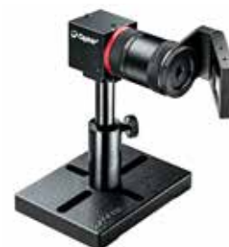
Camera with 4X Beam Expander SPZ17022 and SPZ17027 Beam Splitter

Shown is an image of the tip of a single mode fiber measuring 16\mu\text{m} by 30\mu\text{m} in the two axes. The beam width as measured on the profiles shows 4X the actual size so we can measure to a resolution of \sim 2\mu\text{m} .