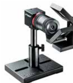
Camera with 4X Beam Expander SPZ17022, SPZ17027 Beam Splitter and SPZ17026 Beam Splitter