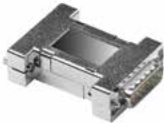
Nova PE-C Adapter