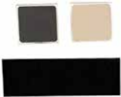
Damage Threshold Test Plates