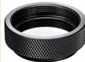
Filter for 355nm

The filter 355nm for monitoring the 3rd harmonic of YAG, transmits 355nm but blocks 532nm and 1064nm