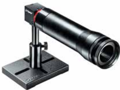
4X beam reducing UV Image Converter as mounted on camera (SPZ17024)