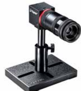
4X Beam Expander with UV Converter (SPZ17022+SPZ17019)