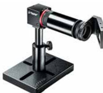
1X UV Image Converter with Optional Beam Splitter (SPZ17023 + SPZ17015)