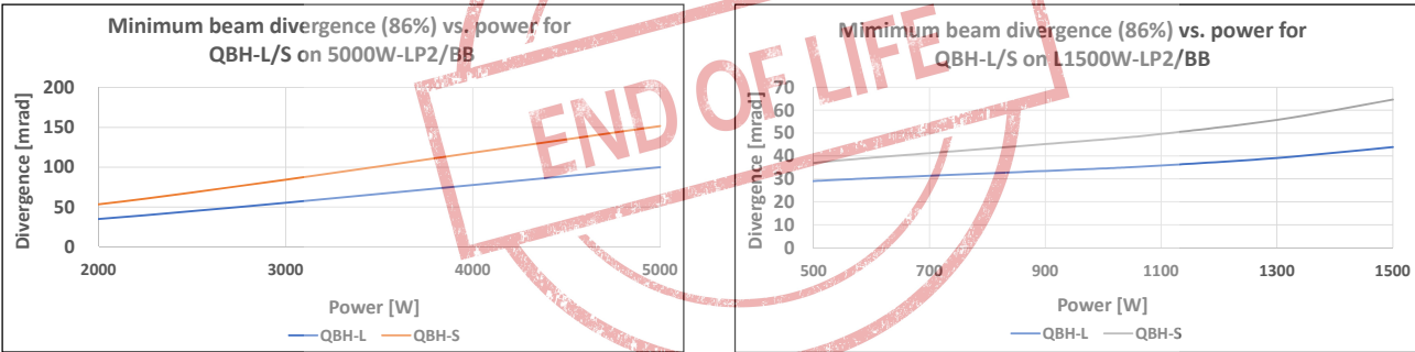
High Power QBH-Fiber Adapter Mounted on a 5000W-LP2-50 Sensor

Note: (a) Please note that older versions of the above sensors do not have the requisite 4 threads on Ø70mm circle on their front flange and cannot be used with the QBH adapter. Note: (b) When using BB type coatings temperature may reach 80°C at midpoint of adapter. Note: (c) The water flow requirements of the fiber adapter are much lower than that of the water-cooled sensor (see the sensor data sheet for details). Therefore, the fiber adapter can be connected in series with the sensor water supply but then the water flow rate of both will have to meet the sensor minimum water flow rates. Note: (d) For Metric water connectors see page 102. Note: (e) Divergence angle given defines radius of beam containing 86% of power, the divergence of 98% of the power is given in brackets. Note: (f) Graphs of beam divergence: