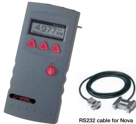
RS232 cable for Nova

Compatible with the complete range of Ophir thermal (power and energy), pyroelectric and photodiode sensors, Nova is truly versatile: measuring power or energy from pJ and pW to hundreds of Joules and thousands of Watts. With the optional scope adapter, you can connect your pyro sensor to an oscilloscope and see every pulse up to the maximum frequency permitted by the sensor. Smart connector sensors automatically configure and calibrate Nova when plugged in. Soft keys guide you through the screen graphics. Finished working? Your configuration can be saved for future use. Nova's autoranging tune screen displays laser power graphically and displays maximum power. Zoom and time scale can be adjusted by user.