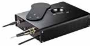
Protective Housing for 1000W / L1500W Mounted on Sensor (shutter open) Rear view (cables)