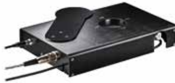
Protective Housing for 5000W / 10K-W / 15K-W Mounted on Sensor (shutter open) Rear view (cables and water connector)

The protective housing and shutter prevent contamination of the sensor, particularly the absorbing surface, by this debris. The housing has a solenoid actuated shutter that can be opened when needed for measuring and be closed otherwise. The protective housing is fastened to the front flange of the sensor (a) .