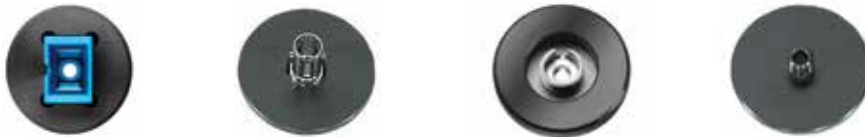
SC fiber adapter ST fiber adapter FC fiber adapter SMA fiber adapter