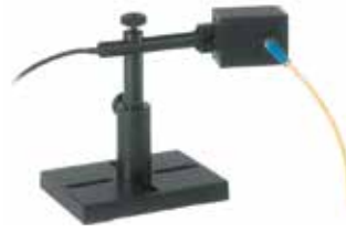
PD300 with F.O. Adapter Mounted