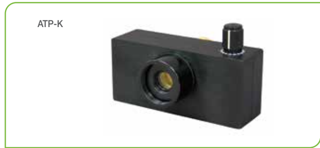
Figure 1 on the right shows the safe average power for negligible beam distortion from thermal lensing. Absorptive filters, such as used in the ATP-K have an upper power limit of approximately 100mW per mm beam diameter. For pulsed beams, Figure 2 shows the damage threshold for energy where breakage of the glass wedge may occur. This is approximately 5J per mm beam diameter. For lasers with power or energy levels above this the first stage of attenuation will need to come from our line of high power reflective attenuators.

The ATP-K is also designed to be used with the HP-series, high power attenuators and beam splitters. Both types of attenuators attach directly to the ATP-K via C-mount while a Beam profiler camera is attached from the opposite side. The ATP-K has simple reproducible attenuation settings, and has a wavelength range of 360 to 2500+ nm.