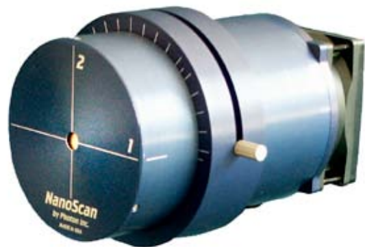
High-Power NanoScan with cooling fan