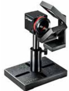
SPZ17015 + SPZ17026 (used either singularly or stacked)