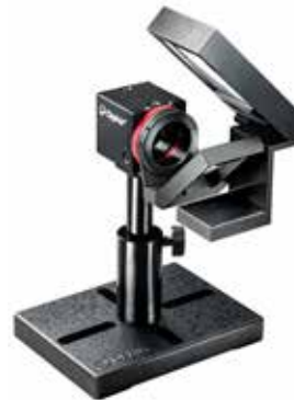
SPZ17015 + SPZ17025

For converging beams, a larger aperture splitter can be used either by itself or stacked (as shown)