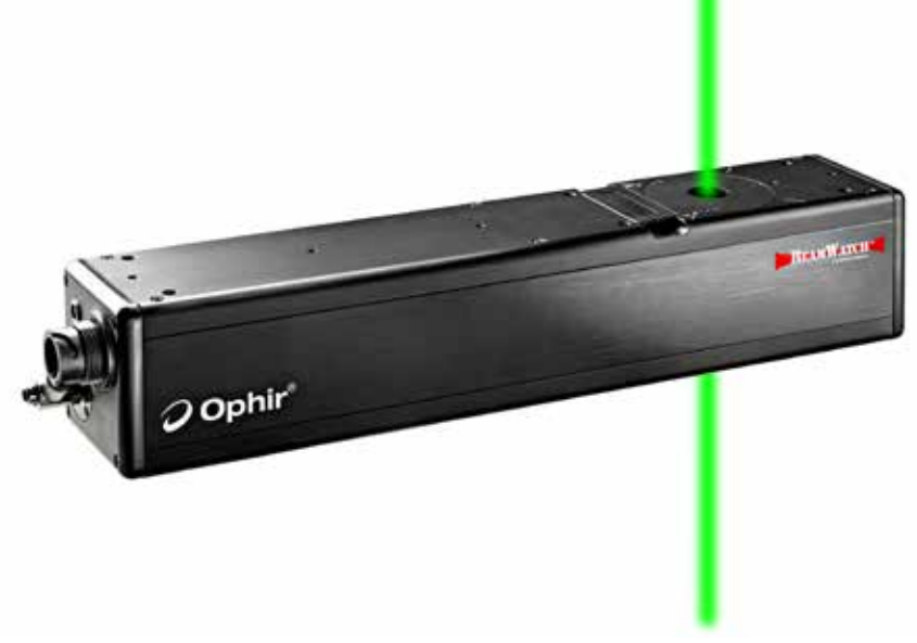
Output Beam (Beam has not been touched)

The BeamWatch®Plus is capable of measuring both NIR and VIS high-power lasers with small focal spots while the BeamWatch® designated for high-power lasers with larger focal spots at NIR.